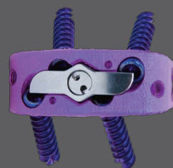
Footprints XS | 32 x 21 S | 32 x 24 L | 36 x 26 XL | 38 x 30